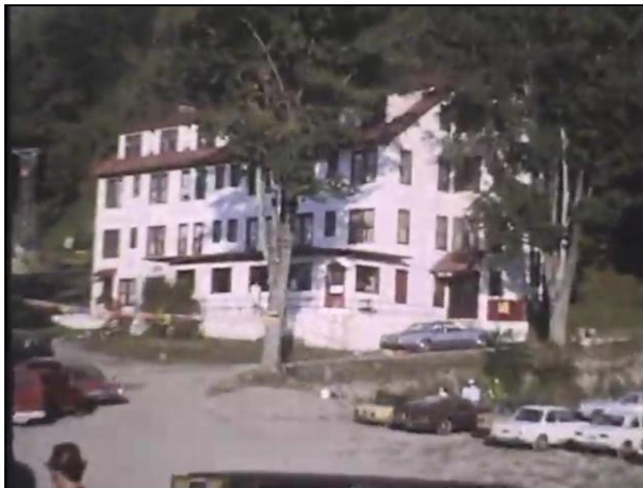
1. Mount Cathalia Lodge

When the big weekend arrived there were, to say the least, some ominous signs. Most notable was the condition of the roadway, for which the claim of comprehensive repaving seemed dubious, though drive-able. The condition of the lodge was nothing to brag about either. Apparently, this was common knowledge among the PHA, as they were notable by their absence.