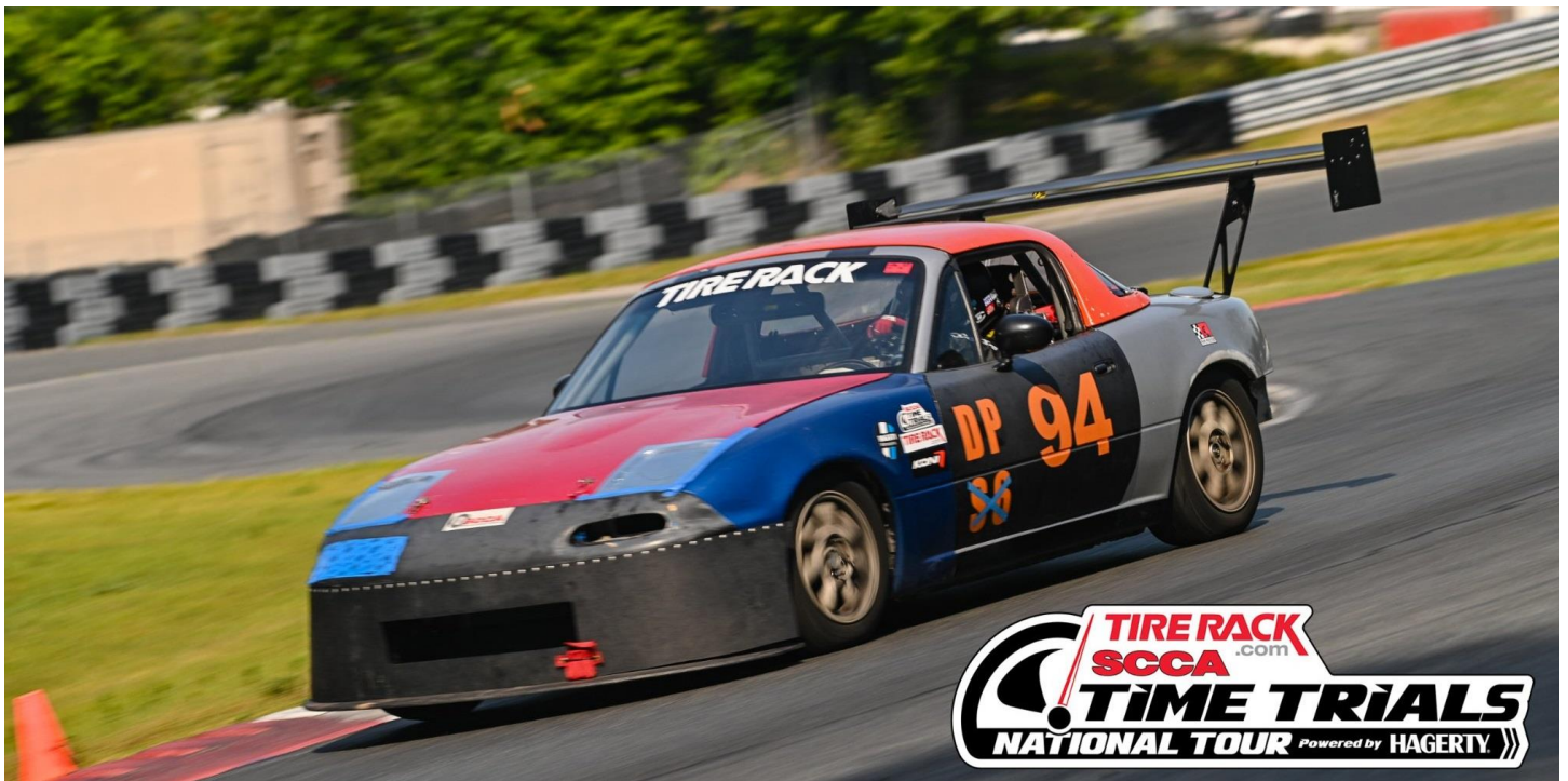
The latest Sal Special Miata, competing at the 2022 TT National Tour @ Thompson Speedway

This past 4th of July weekend was the first time that I got out to a national TT with the new car. My goal was to get below 1:30 in the car at Thompson. My personal best was a 1:25 in the Mustang. The first session out I get a 1:29. Well, time to pack up and go home. I lower my goal to a sub 1:29. Next session out I get a 1:28. I figure that I can't possibly do any better than that. For day 1 I was right, the heat caused a slick track. Day 2 I go out for my first session and the car feels good. I cross the line and see 1:27.5 and celebrate like I won my first F1 race. Fist bumps, screaming, all of it. I ended up getting down to a 1:27.1, with more time it will easily be in the 1:26 range.