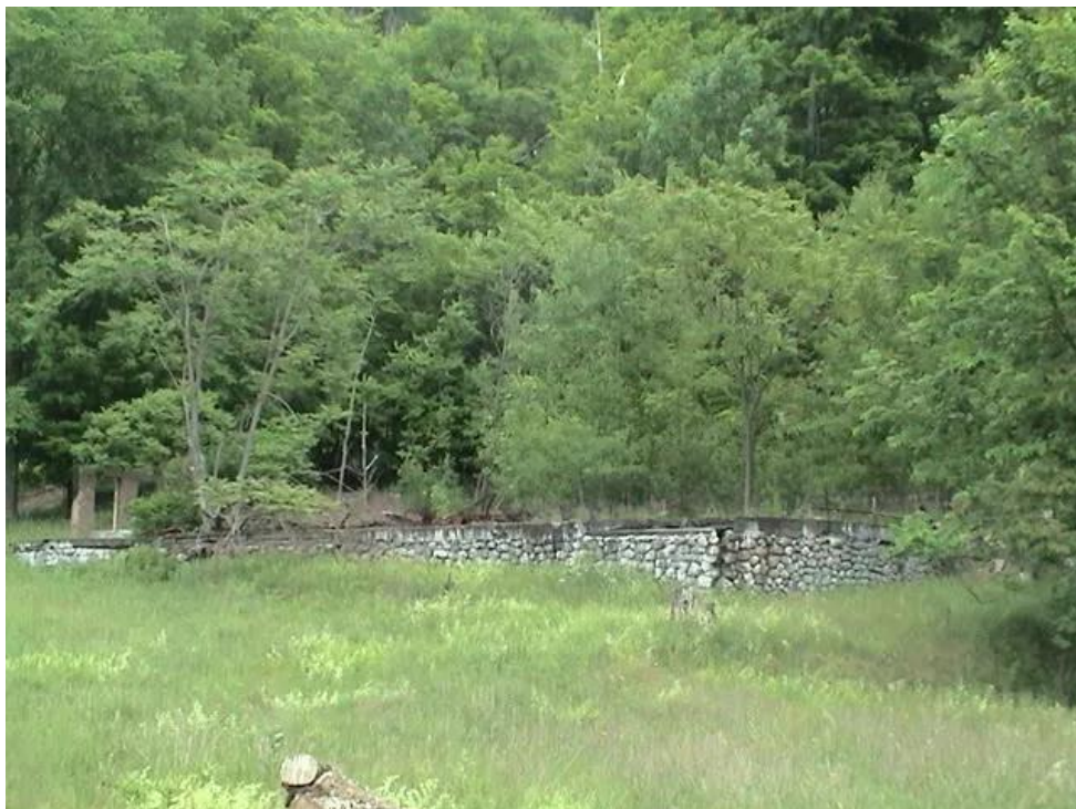
4 Mount Cathalia Lodge's stone wall