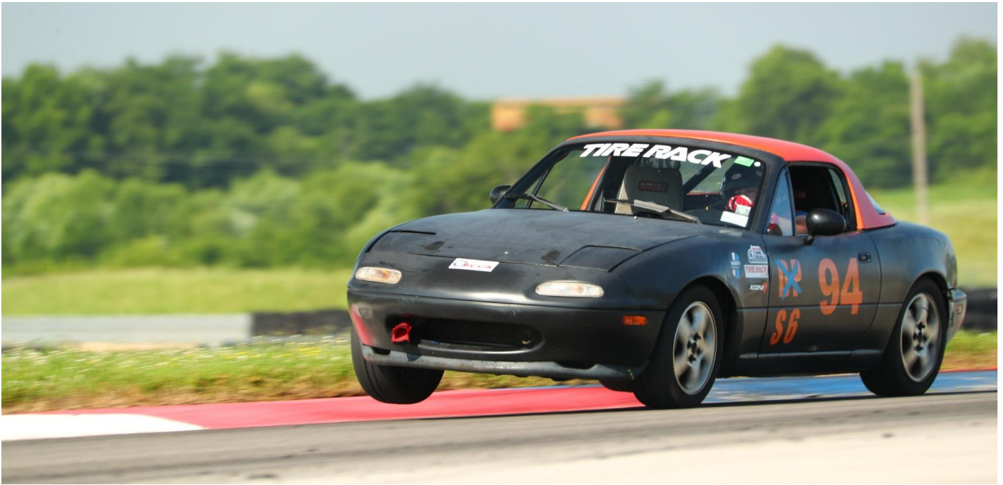
The author at the 2021 NCM Time Trials in his (first) Miata