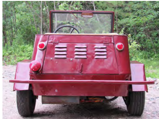
Spec-Midge Model 2 With Street Tires for Track Night in America (before cage install)