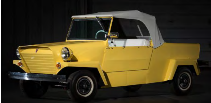
Stock Model 3 and Spec-Midge R Running Gear

For Club Racing , the Spec-Midge R will be based on the King Midget Model 3 or a transformed Model 2 with 115 lb. lower weight allowance. Running gear will use the Mazda Miata X-frame, shortened by 13 inches. "Fortunately we have a stockpile of over 200 such units stored in building 7 of the Philip Billard Municipal Airport in Topeka, the result of over-optimistic expectations for the MSP (Miata Sports Prototype) series announced in April of 2018," according to Eric Prill, SCCA VP for Competition. Allowable body modifications for Spec-Midge Rs include a rear wing and wheel flares, while tires will be Hoosier SM-7s and SM-Rs