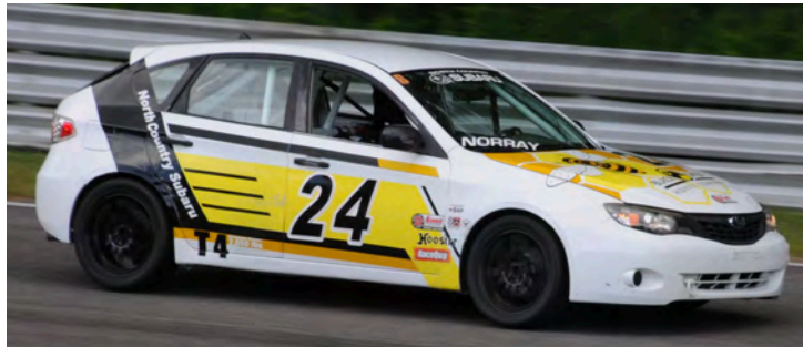
Maclin Norray Touring 4 Subaru Impreza