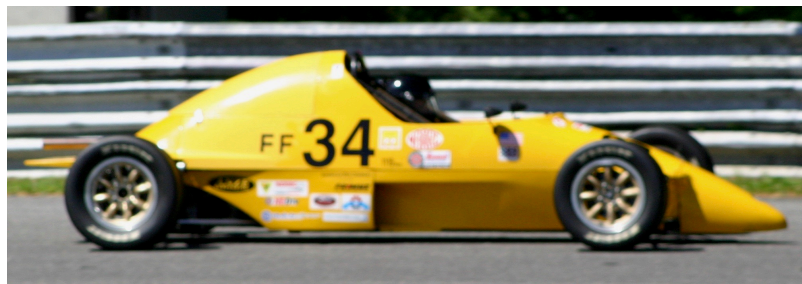
Chip VanSlyke Formula Ford Crossle 62F