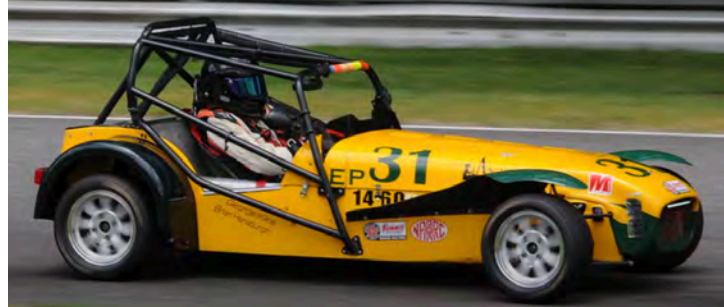
George Kline E Production Caterham Super (think Lotus 7..)