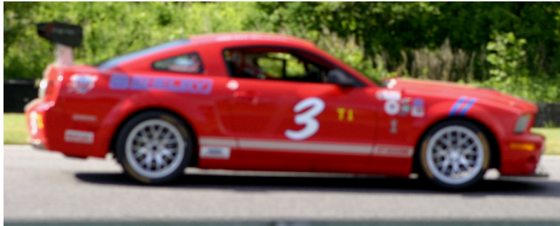
Ken Relation Touring 1 Ford Mustang "Rebecca"