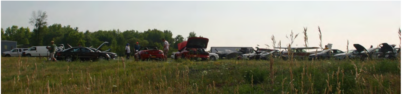
Dawn in the Solo Paddock – note entrants in the new Aero class

On Saturday, July 14 th , MoHud had its second solo Test & Tune session at the Empire Aerosciences site in Glenville. 31 drivers ran the course, of which 10 were new/ weekend members.