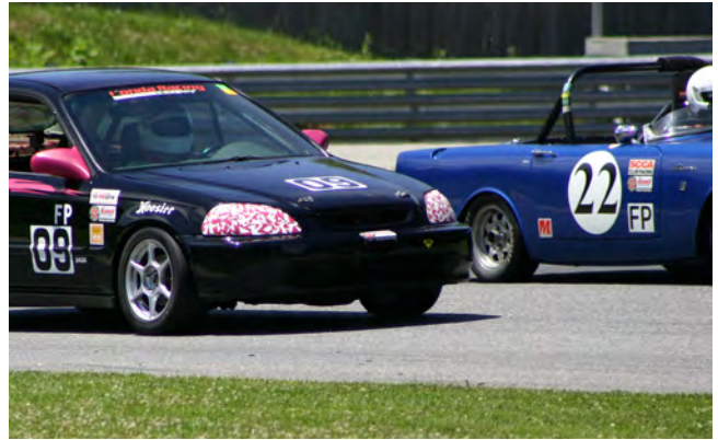
...but serious: Jim Bucci at speed