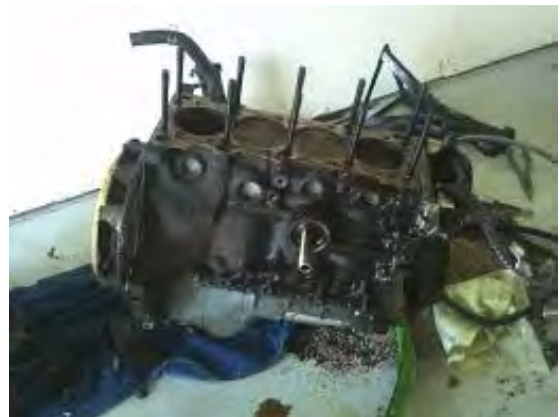
This is a typical Miata engine after it blows up.