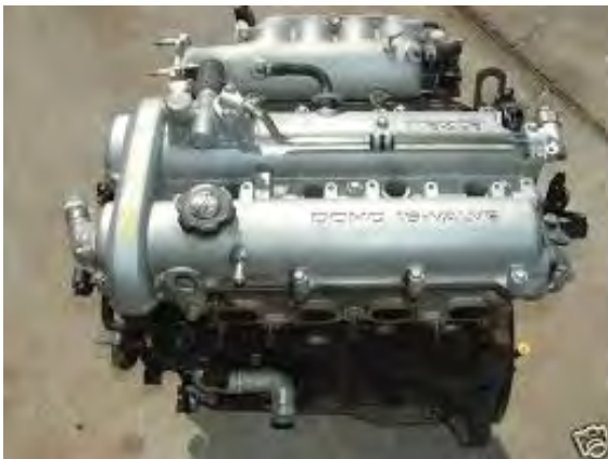
This is a typical Miata engine before it blows up.