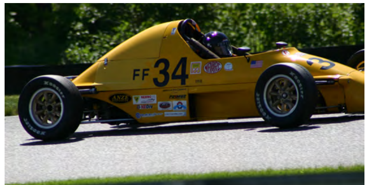
Chip VanSlyke speeds by the camera