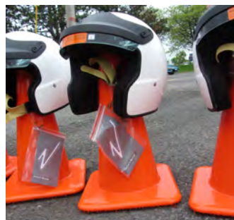
The New Helmets