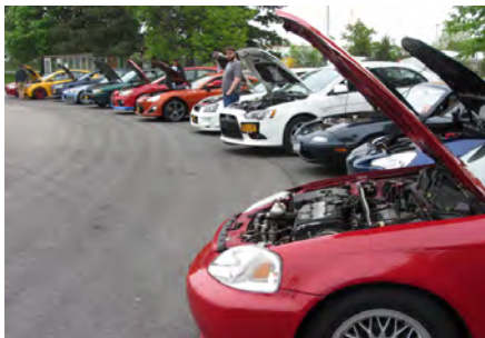
Lined Up for Tech