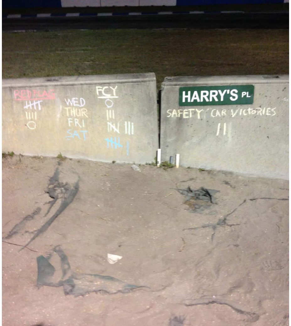
Flaggers track the Full Course Yellows for the event, as well as "Pace Car Victories" (races ended under cautions)

So, why did the chicken try to cross the track? Well, one of the fan camps known as "Dodge City", where the fans build (yes, build, as in wood, nails, hammers - one of many construction efforts I witnessed by fan groups) a replica store front of an Old West saloon, complete with porch, a fake cactus, and an inexplicable TV set that has