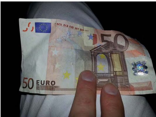
Sometimes it pays to walk the track before the race day begins.

Saturday was the big day for the 12 hour race. Racing got underway around 10:30am, and continued right up until the ending fireworks at 10:40pm Saturday night. We had a total of 11 flaggers for our three turns, which we turned into four teams of two flaggers, with the three corner captains - Rich, Mack, and Dave Hsu of DC Region, acting as floaters. The four flagger teams would rotate between Turn 10 flags, resting, Turn 10 Comms, and Turn 11. Turn 9 was left unmanned due to the lack of sufficient flaggers. Turn 10 required the use of hand signals as the flags were approximately 75 feet or more up track from the actual corner, and the Turn 10 Comms team was the only group who could see the full section to Turn 11 if a yellow or white flag was needed for a car. I'd never used those hand signals before, but I was able to pick them up quickly with the frequent use required for the turn. We'd do an hour at each station, with the team that was serving the resting portion being