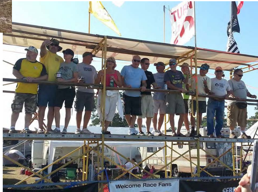
The good folks of Turn 10. They erect the scaffolding.

As a "Fuh-new-gee" (you can probably figure that one out yourself), I was introduced to the Turn 10 fans and given some mild hazing. I had to stand in front of the Turn 10 fans and loudly proclaim "I LOVE PEANUT BUTTER!" - not understanding why at first, until I heard the fans' response. Again, decorum prevents me from adding the other parts that surround that phrase, but it was all in good fun.