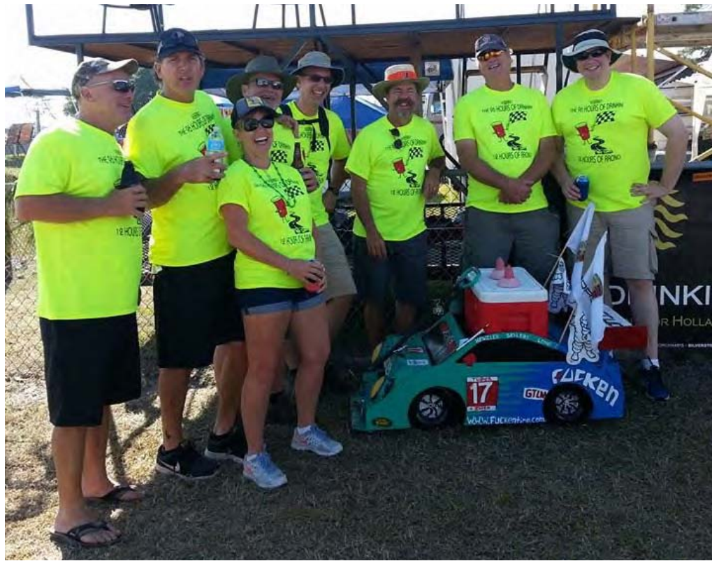
The "96 Hours of Drinking" team, complete with replica Falken Tire Porsche 911 GT race cooler.

On Friday, the CTSC series held their race - a 2.5 hour event. Temperatures were much warmer than normal for that time of year - in the low 90's for most of the days - but I lucked out by drawing duty at Turn 11 Friday, which enjoys being under the shade of a very large tree at that spot on the track. The action at our section of the track was an orange BMW spinning at the exit of Turn 10, ending up facing traffic, and causing oncoming traffic to attempt to split around him. Several cars came together trying to avoid the spun BMW, and ended up damaging each other and the BMW. The BMW lost a left from wheel in the incident, yet got itself turned around with some massive throttle inputs, but in the grass on driver's right. He attempted to re-enter the race surface, not realizing he was missing his wheel and suspension, but a quick signal from me using the universal hand drawn across my throat several times indicated to the driver he should shut it down.