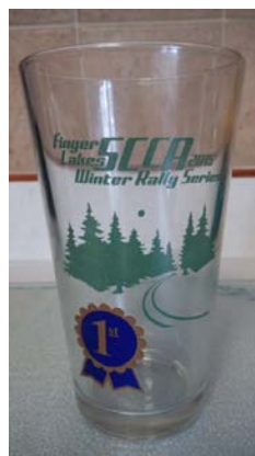
First place trophy