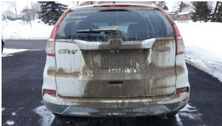
Rallying is dirty work