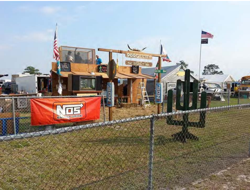
They bring the Wild West to the race, complete with chickens.

the end of the race day - the same adult beverages they'd been making available to themselves for most of the day and over the course of the four days of racing.