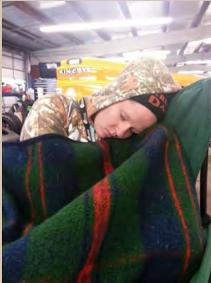
Tough work being part of the Team Bucci crew