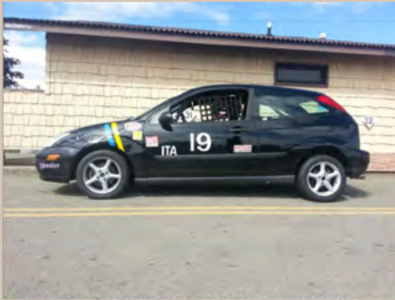
The #19 Ford Focus on the grid