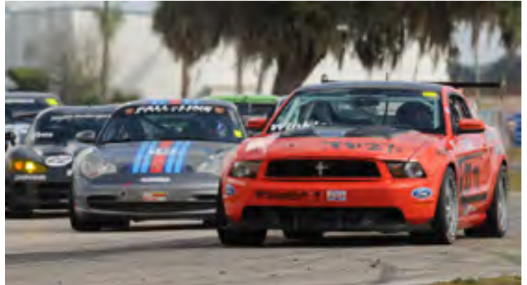
The 2015 Majors schedule includes a traditional January stop at Sebring.

The Conferences based in the snow belt open later, with the Northeast sharing its opener with the Southeast in a dual event at VIRginia International Raceway in April, and the Northern Conference opening May 2-3 at Blackhawk Farms.