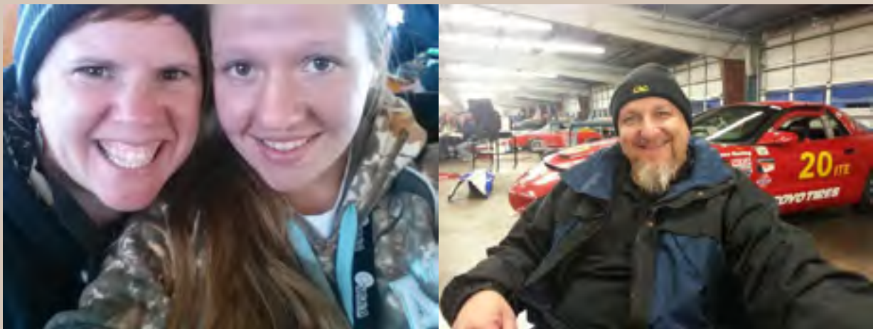
It was a chilly weekend at The Glen