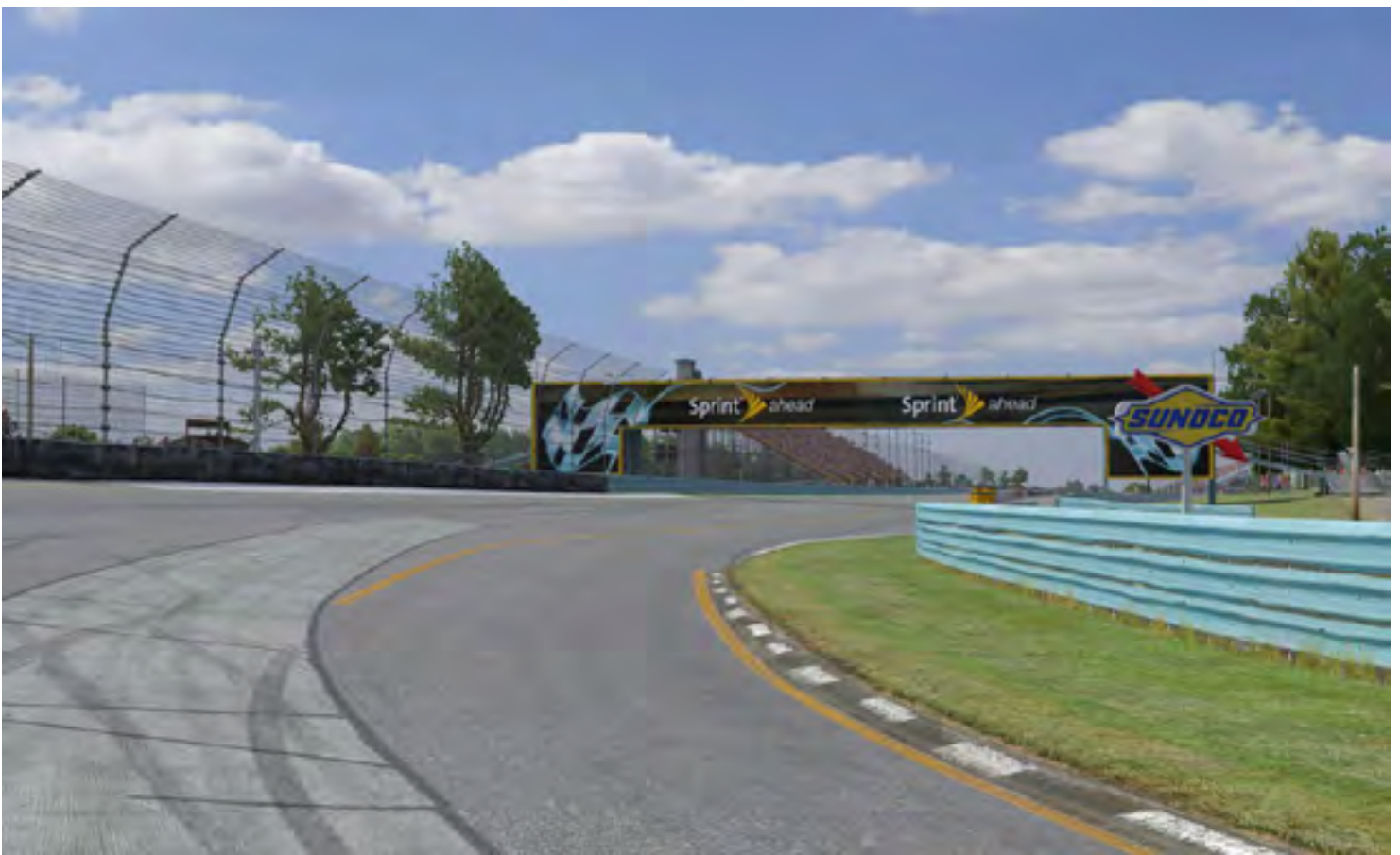
Watkins Glen International's final turn.