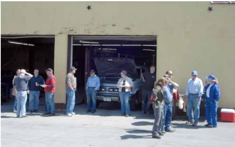
Tech party of 2012

Don't forget about the annual Tech party at Bob Karl's Sales & Service on Saturday May 3rd.