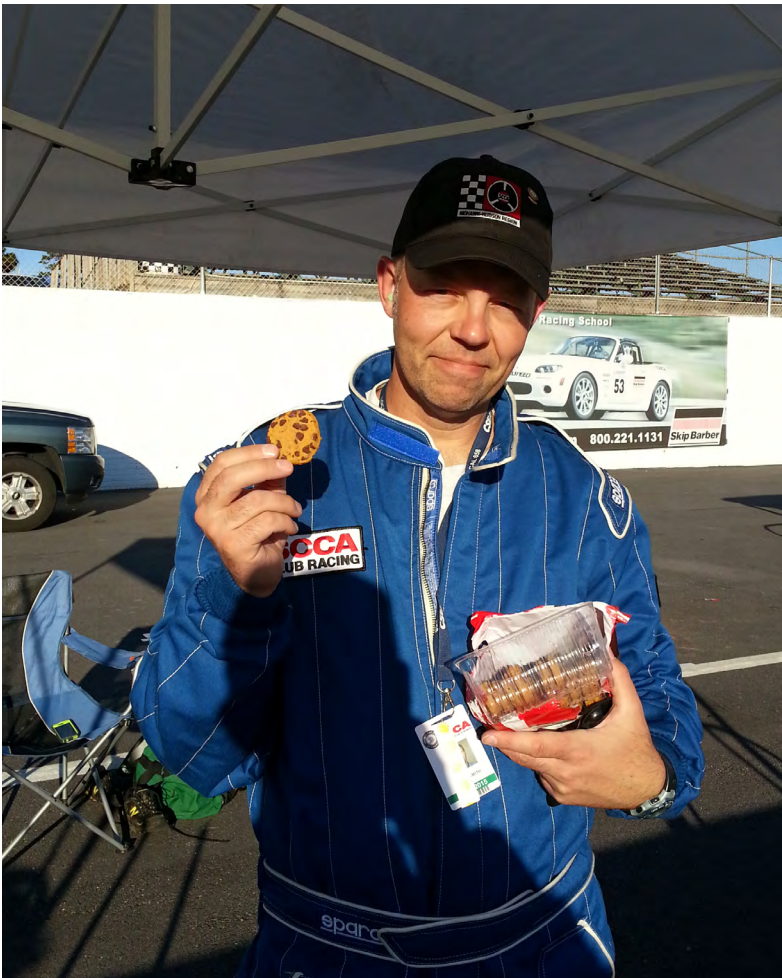
Tough-cookie - when the going gets tough, the tough have a cookie while they wait for their car to cool down during the enduro.