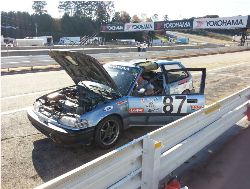
No-tires-brakes-coolant - in addition to the overheating, we found our Hoosiers had finally heat cycled out, and our brake pedal picked up a very long travel.

Will ended up coming in within 15 minutes of the start of the race, the engine temperatures pegged once again. We discussed what we wanted to do, and decided we'd let it cool a bit, get me in the car for a short stint, and then see if we could limp it to the finish in this manner. I took it out and quickly discovered Will failed to mention that our Hoosiers were now shot, and the brake pedal had a disconcertingly long travel characteristic to it, making it hard to drive on the edge with any sort of precision. I lasted about 10 minutes before I too found the need to come in.