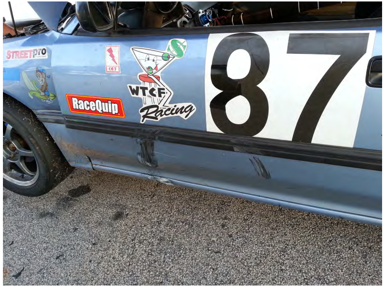
Rubbin-racing - Eric helped Will's car look more the part of a race car by making sure it got a nice tire circle adorning the driver's door.

Sunday's schedule included Will and I volunteering to instruct in the PDX that took place during the quiet morning hours observed by the track to accommodate Sunday church services in the area. We had a good time doing it, and found it didn't make our preparations for the afternoon enduro as crazy as we first anticipated. The enduro uncovered the fact that we had not discovered the source of the overheating problem with our Friday night repairs. The enduro rules required two five minute stops, so Will and I devised a plan where Will would drive a 40 minute stint, come in for the first pit stop, then I'd go out for a 70 minute stint, and then hand off to Will to finish the last 30 minutes and take the checker.