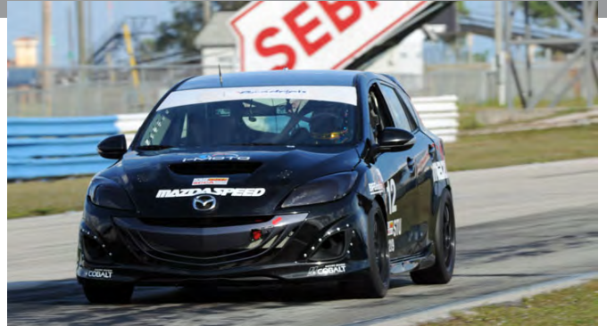
Image: Glen Bocchio took a pair of STU wins at the BFGoodrich Tires Super Tour.

A full course yellow packed the group two race on lap six, reforming a battle in Formula Atlantic between Saturday race winner Sedat Yelkin's No. 75 Everclear Swift 014/Toyota and Keith Grant's No. 40 Mazda/Hoosier/Polestar Swift 016/Mazda. Both drivers led at least