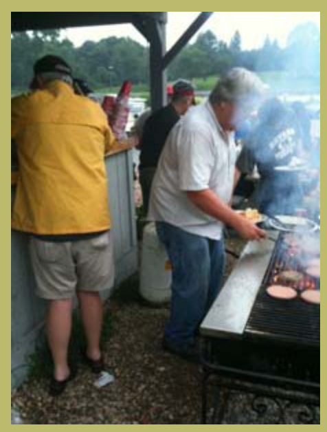
Look at those legs, woohoo!