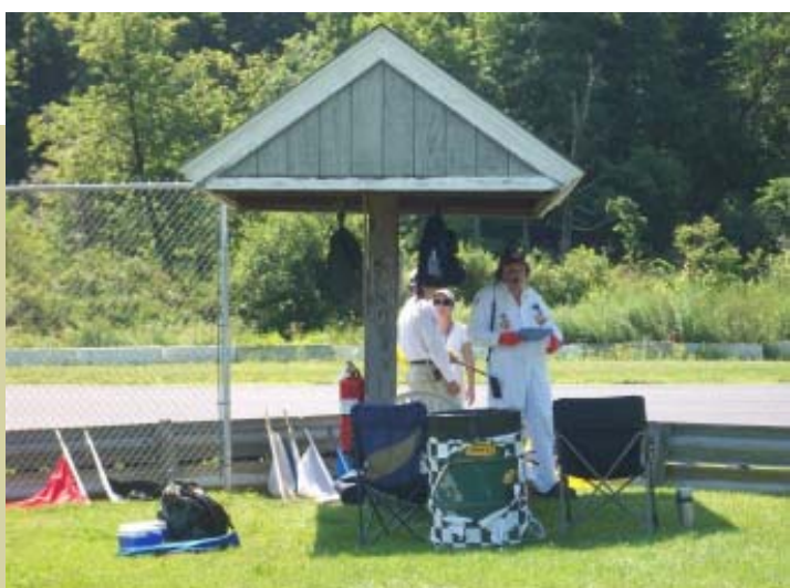
All the great workers kept things running smoothly for drivers.

Tech tent kept the workers cool and dry during the long work day.