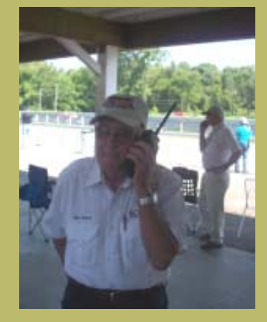
Can you hear me now?