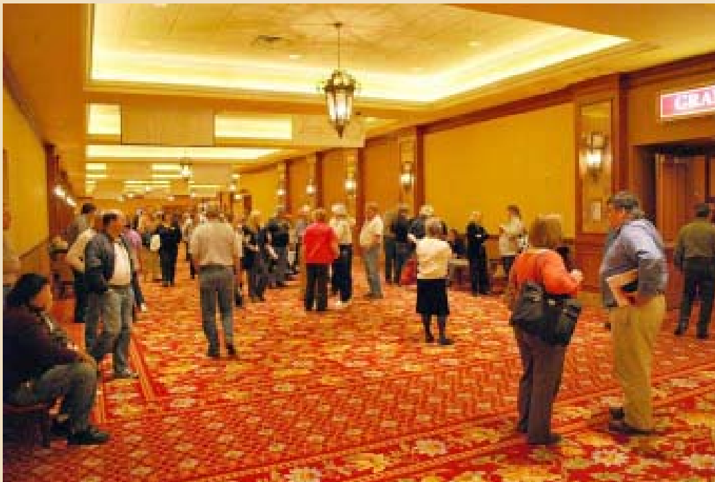
The crowd mingles in between sessions at the SCCA Convention.

The 45th SCCA National Convention concludes Sunday. Presentations and audio recordings from various sessions will be posted to scca.com shortly after the event.