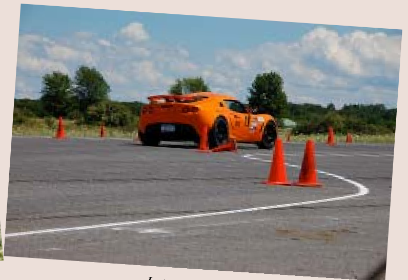
Lotus on course