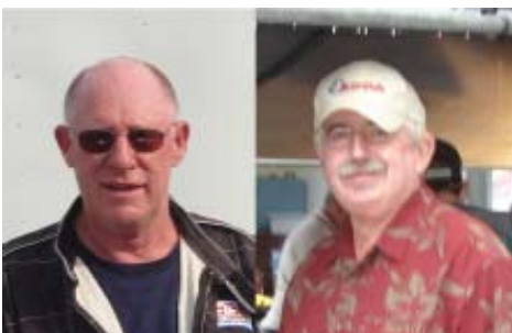
Two of the usual suspects in their comedy roles as Kings of "Stuff".

Send in your info to the editor and find a worthy recipient, or not. Your junk may be someone else's treasure. Stop just moving your "sh_ _" around.