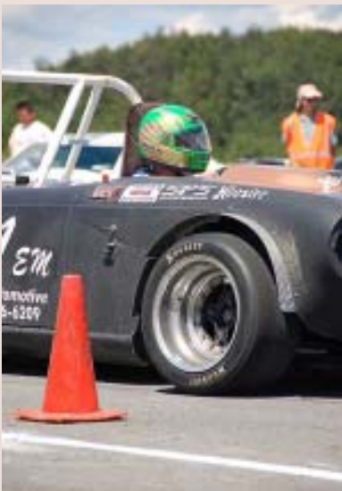
E Mod car (unknown driver)