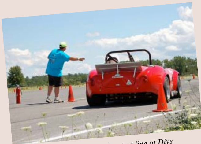
An E Mod car at the start line at Divs