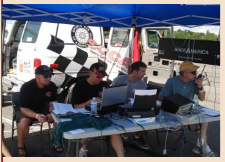
The timing and scoring crew hard at work!

A beautiful day at the Seneca Army Depot