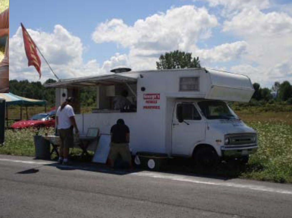
Georges Mobile Munchies provided both lunch and the Barbeque Dinner on Saturday night.