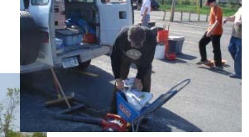
Packing it up!