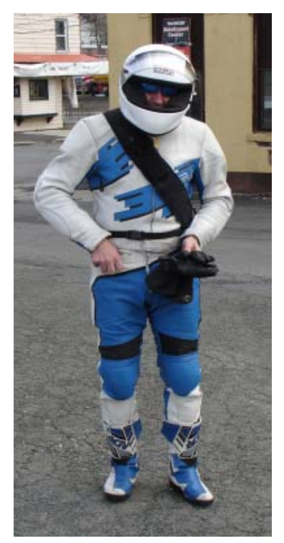
Superhero or Racer? Hard to tell!

Keep checking the web site and message board for more details.