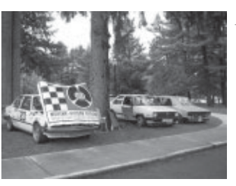
My solo BMW heads the pack