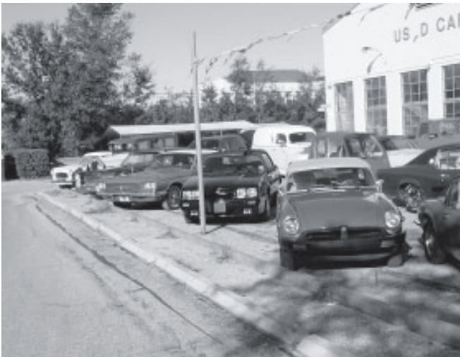
The side lot- Nash Metropolitan, T-Bird, MGB etc.