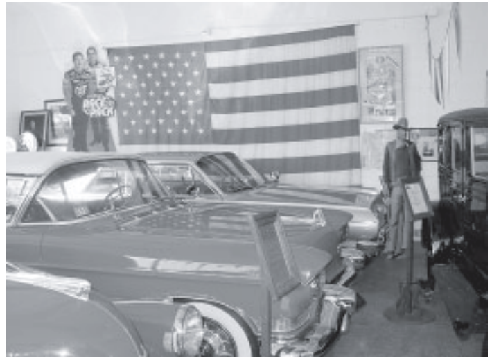
The Duke liked the '58 Caddy.