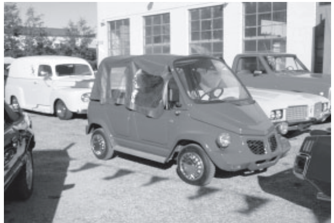
This Chinese one cylinder car has two gear shift levers, one for forward the other for reverse.

a Metropolitan, an MGB, a 65 Beetle and a number of other interesting cars.