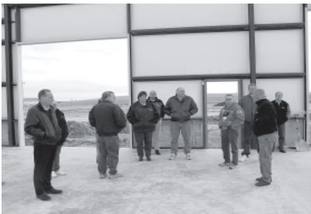
Exec Stewards and Staff inspecting new tech building at Heartland Park

I have only been to five National Conventions, one in Boston, the rest in KC, but I can heartily recommend that any member attend. The Convention will be in San Antonio for the next three years so treat you to a warm February trip next year. You will enjoy it.