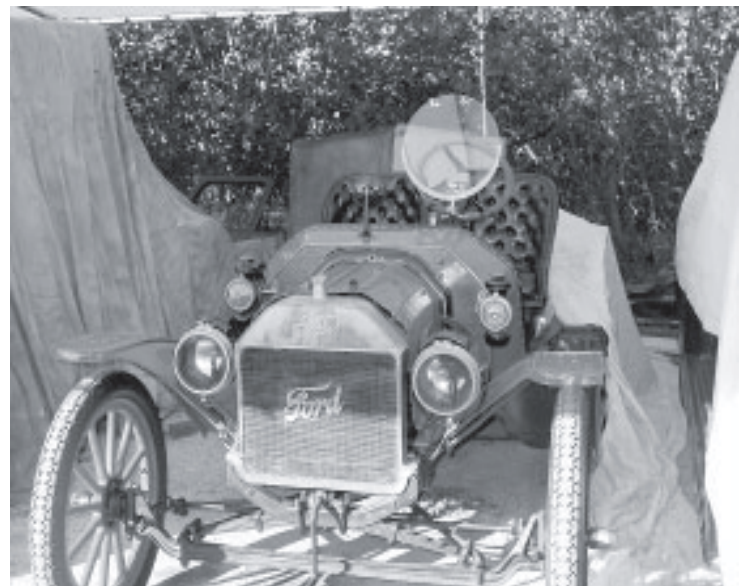
Look under a tarp and this is what you may find.