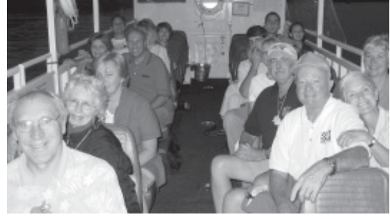
Woah! They sure pack in those ducks, don't they?

the boat is works and assured us it is both land and sea worhty.