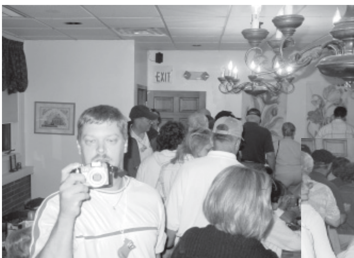
Think we had way too many photographers on the Duck Tour?

These people continue to help MoHud live up to our party reputation!!