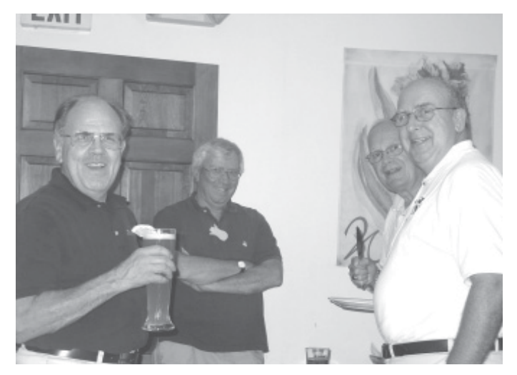
Look who found a "large" liquid refreshment.

These people continue to help MoHud live up to our party reputation!!