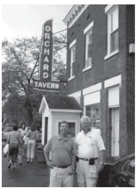
Our meeting place stands proudly!!