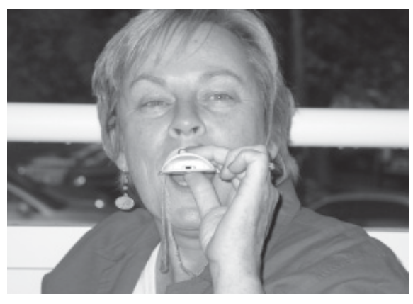
NER is all it's "quacked" up to be.