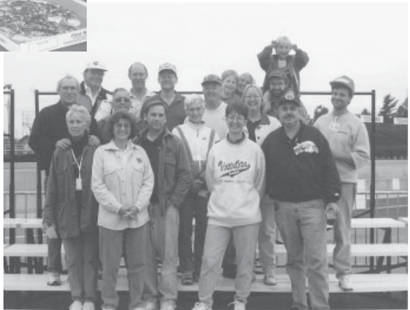
Quite a motley crew! Where are they all now?