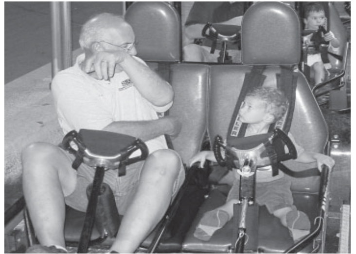
Grandpa, you're too big!

A picture is worth a thousand words! The August "meeting" was a great success! If you missed it, come next year!