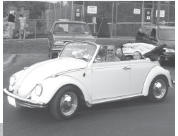
How did the bug get in?