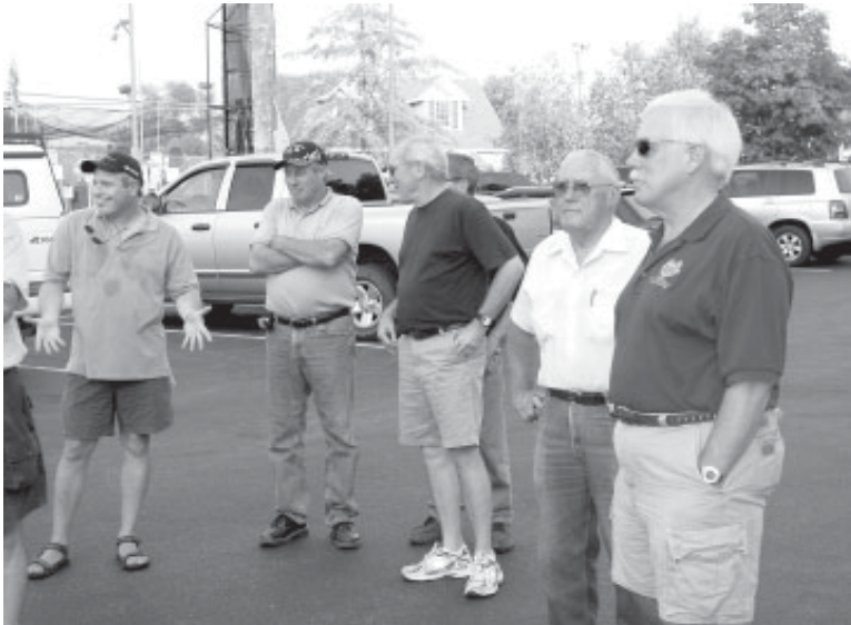
I'm not sure we have a quorum?