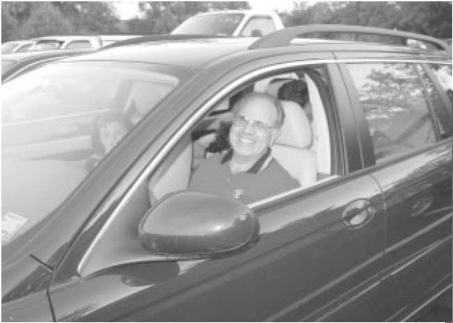
MoHud's reputation for fun attracts all sorts. Here come those Hathaways!!