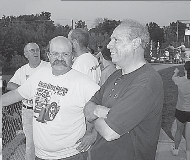
Our fearless leader is seen checking to make sure the "kids" are behaving themselves.