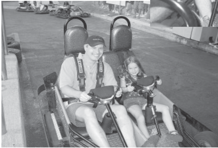
Just watch mee, honey!