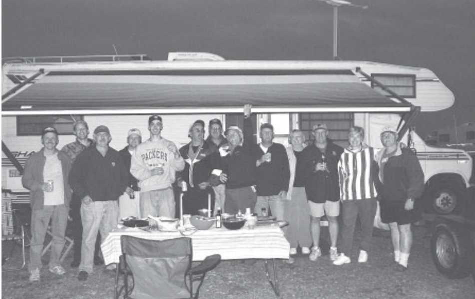
Isn't it nice seeing one of the SCCA directors holding things up for the rest of the race groupies?