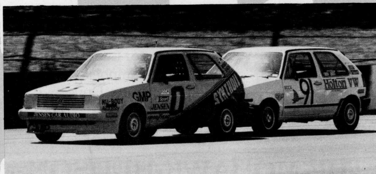
Paul Hacker in Car 0 at 1985 Pocono VW Golf Cup Race