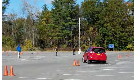
Practical Demonstration of Weight Transfer During Hard Evasive Maneuvers