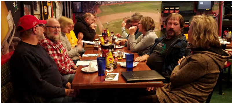
Bench Rallying Afterward!