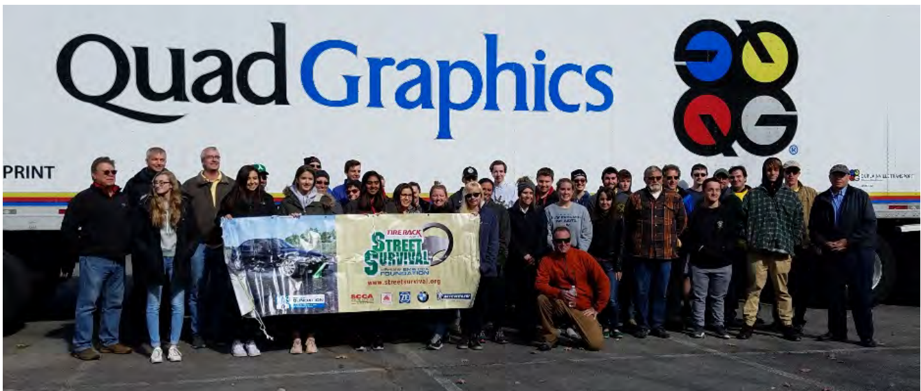
Below: Graduation Picture