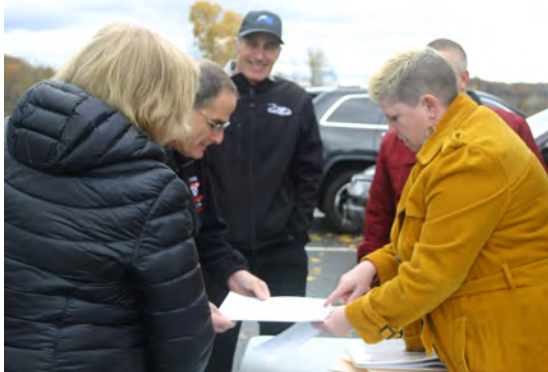
Team Bass is Briefed

Hopefully you're aware that MoHud hosted a rally back in November. Or, perhaps, you even participated in the rally and know how much fun it was.