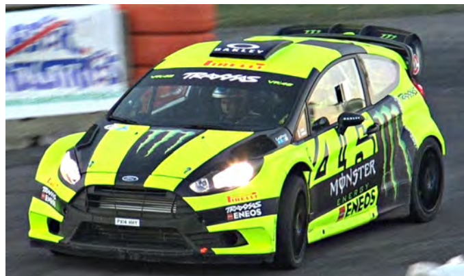
Vintage Valentino Rossi